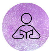
Continuity of Care