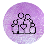
Educational Materials & Programs

Enrolling in IPSEN CARES is quick and easy.