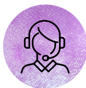
Dedicated, Individualized Support