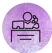
Financial & Insurance Assistance